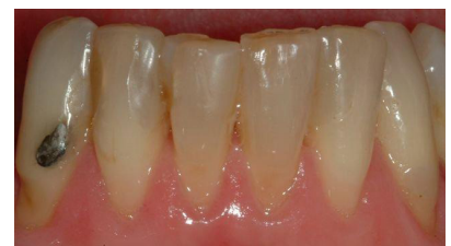
Examples of silver fillings