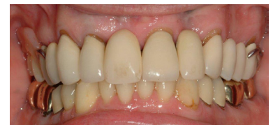
Removable Partial Denture replacing upper teeth

RPDs, even under the best of circumstances, DO NOT have the same chewing efficiency as natural teeth. The ability to chew food depends on the stability and retention of the denture. Stability and retention are affected by many factors, including the attachment of the denture to natural teeth as well as the amount and type of bone, gums and saliva present in the patient's mouth.