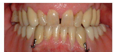
Removable Partial Denture replacing lower teeth

To keep the tissue under the appliance healthy, your RPD should be left out of your mouth during sleep. The teeth in the RPD are not as strong as your natural teeth and you will not be able to chew as heavily on them. The appliance will tend to get food trapped underneath it and you may have to remove and clean it after eating.