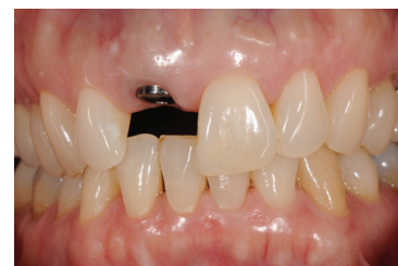
Implant Before Crown Placement