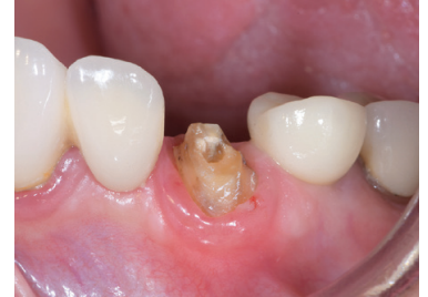
Pre Build Up

A build-up may break or loosen if chewing very hard or sticky foods.