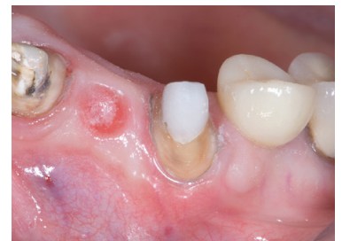
Post Build Up – Composite Material