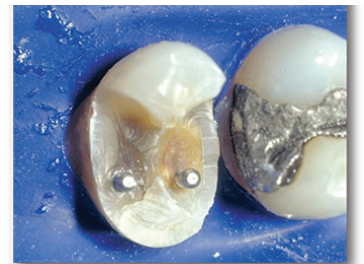
Requires a Build Up